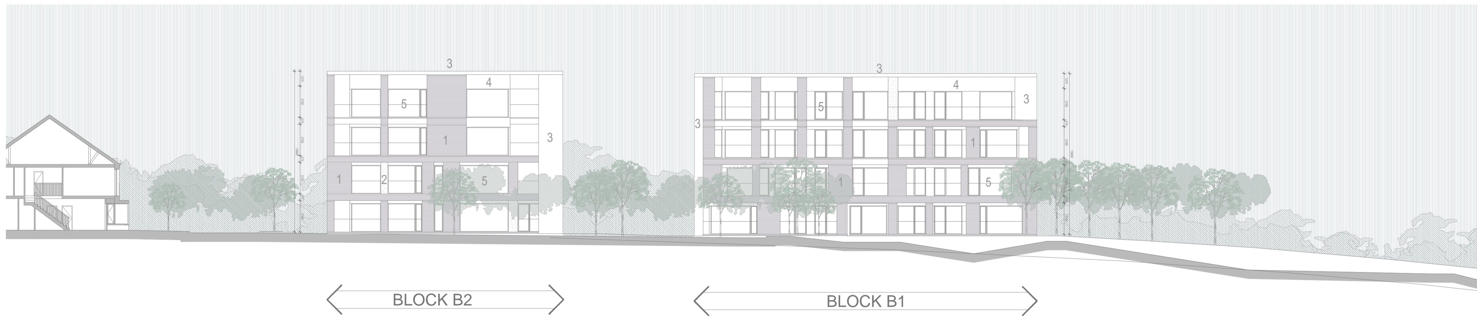
BLOCK B1,B2 & B3 - SECTION CC SCALE 1:200@A1