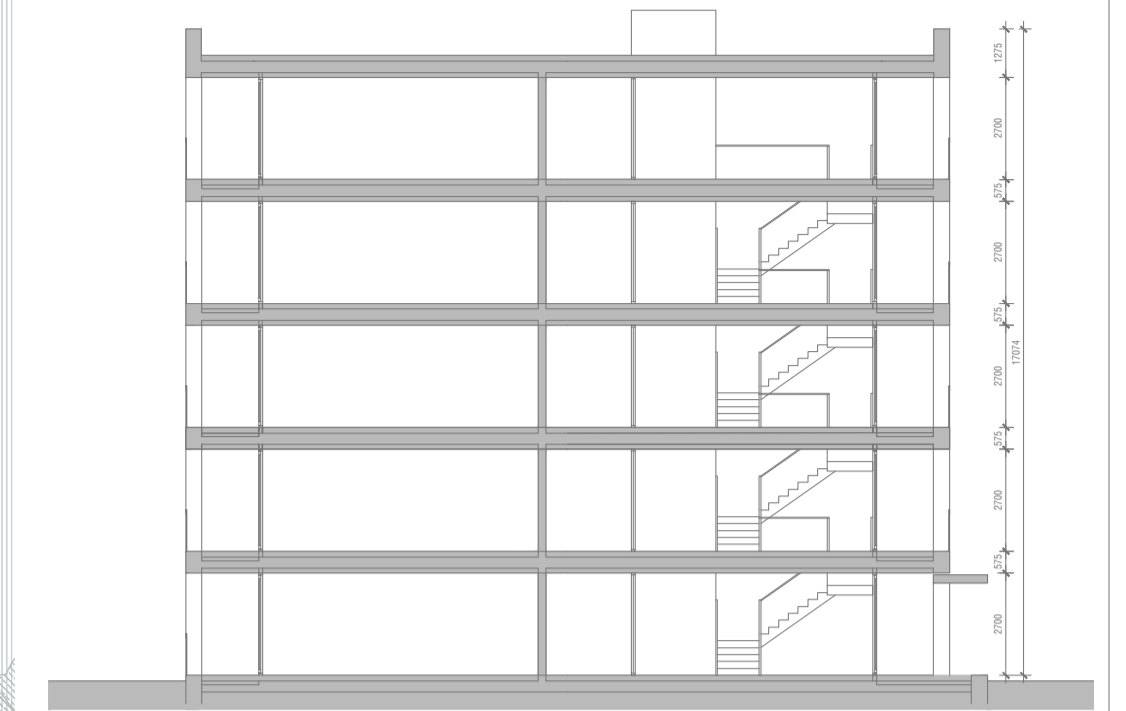
BLOCK B3 - SECTION AA SCALE 1:200@A1