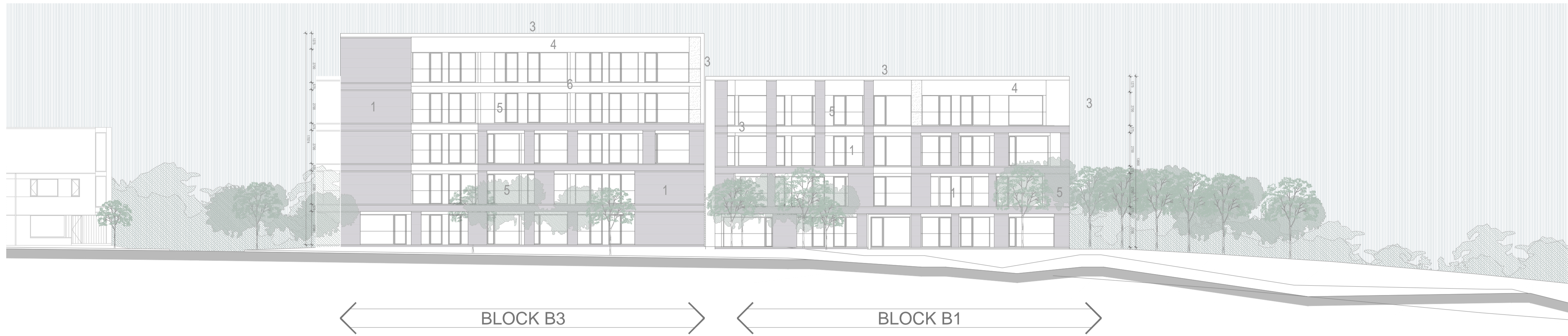
BLOCK B1,B2 & B3 - BOULEVARD ELEVATION SCALE 1:200@A1